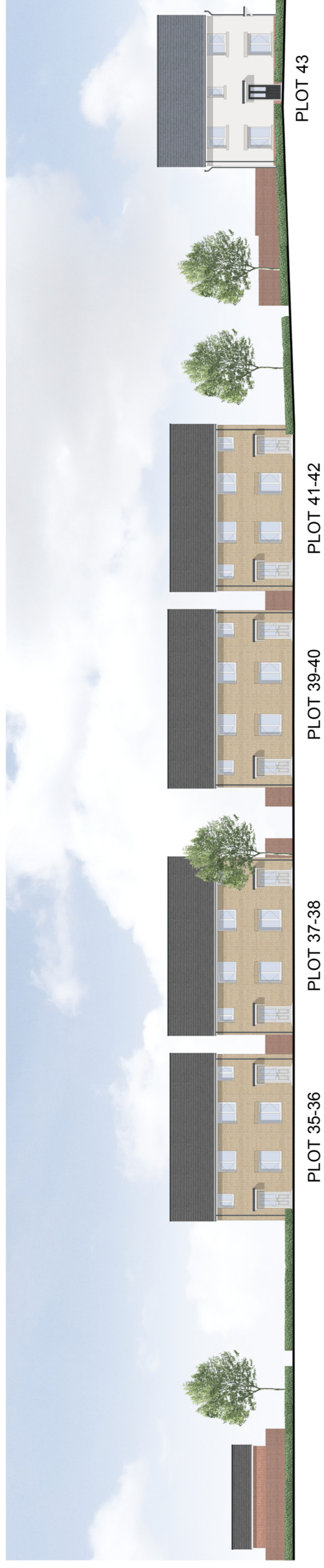
Section E-E' (Part 2)