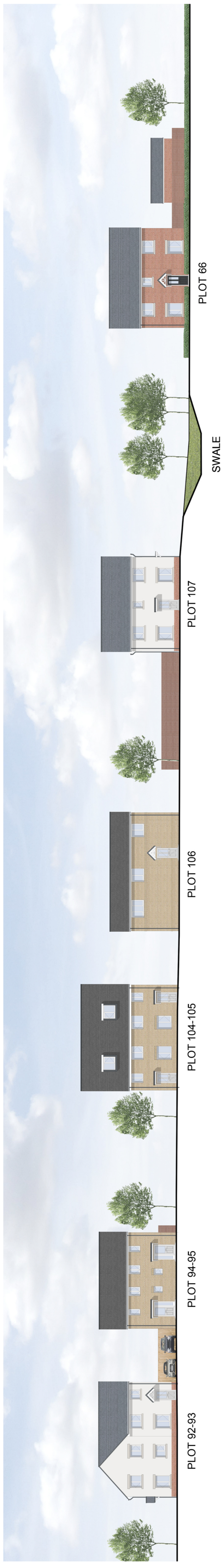
Section E-E' (Part 1)